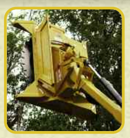
SAW BLADE 48" saw blade diameter