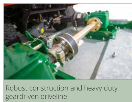
Robust construction and heavy duty geardriven driveline