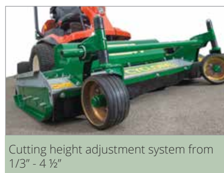
Cutting height adjustment system from 1/3" - 4 1/2"