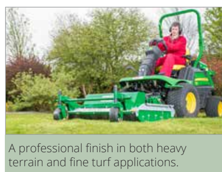
A professional finish in both heavy terrain and fine turf applications.

It is a flexible mower that delivers a professional finish in everyday grass mowing applications yet easily copes in much tougher mowing conditions.