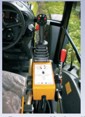
Low Pressure Hydraulics