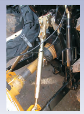
Tubular 3pt linkage kit