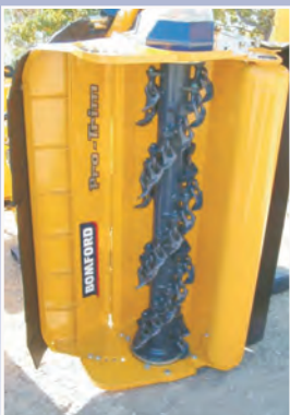
Pro-Trim flail head

The Bomford Hawk "Evo" offers 4 types of arm control including the proven top of the range ICS (Intelligent Control System) that provides fully proportional fingertip control with programs tailored to suit the operator. Hawk joystick controls are equipped with large capacity fan controlled oil coolers to ensure all day long performance. The Pro-Trim 1200mm or 1500mm flail cutting head is the popular choice with proven features like the top drive hydraulic motor for reliable power transmission and compact dimensions, also the double spiral rotor shaft provides a strong mounting point for the 6 types of interchangeable flails depending on the type of vegetation and conditions. With our forward arm models a new 180 degree head turntable ensures a tight transport width. In addition to the Pro-Trim flail head, Bomford can offer Sheartrim cutterbar and Pro-Saw attachments to tackle brush and tree growth. Durable powder paint finish and new high visibility LED rear lights ensure your Bomford Hawk will be visible when working on the highways.