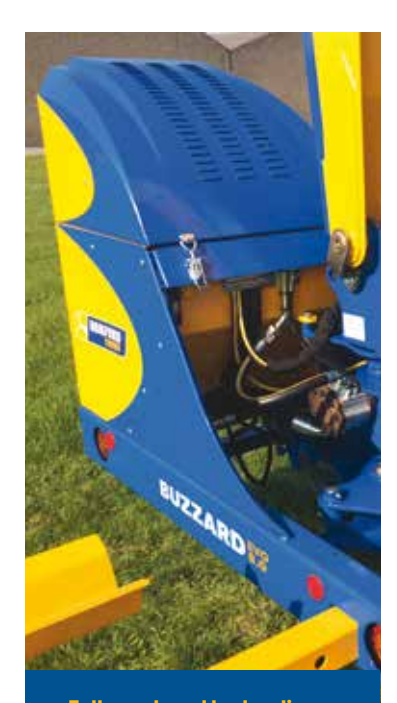
Fully enclosed hydraulics Keeping components protected from the elements.