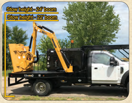
Stow Height - 13' 5" for 24' Boom Stow Height - 11' 8" for 22' Boom

The Tiger TrucKat Boom Mower can be purchased as a turnkey unit with the Ford F550 FWD chassis, or as a truck bed mount designed for 36,000 GVW trucks with dual steering similar to the Freightliner M2 series.